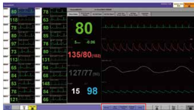
5 function keys

Five function keys at the bottom of the screen give you instant access to frequently used windows and functions.